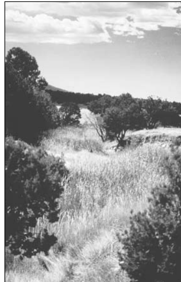
Sid Goodloe's riparian area.

Sid has demonstrated innovative and sustainable methods of land stewardship, contributed significantly to public education about sustainable uses of natural resources, promoted and implemented the collaborative process in resolving land stewardship conflicts and has demonstrated proactive leadership in promoting and achieving land and community health.